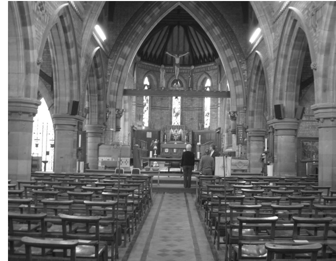
Looking East along the church to the high altar

All Saints' Church may be open for prayer in the week beginning 22nd June - - more details next week.